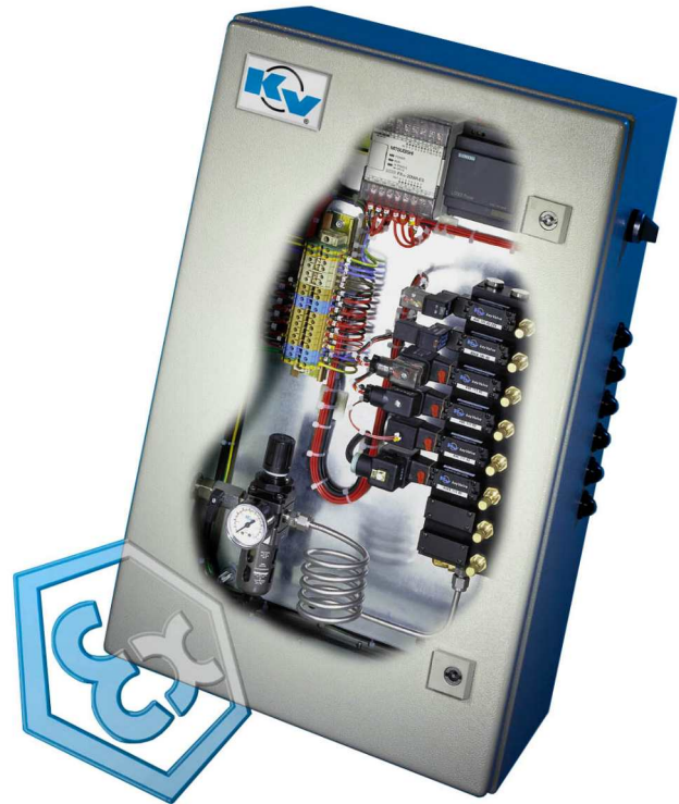
Cabinet for process plant