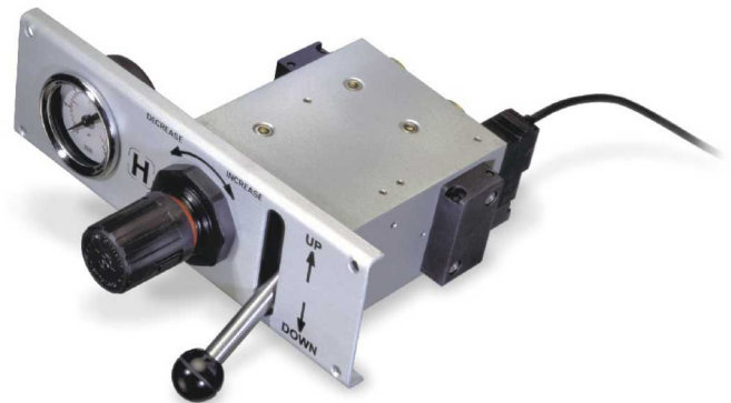
Axle raising and lowering control unit