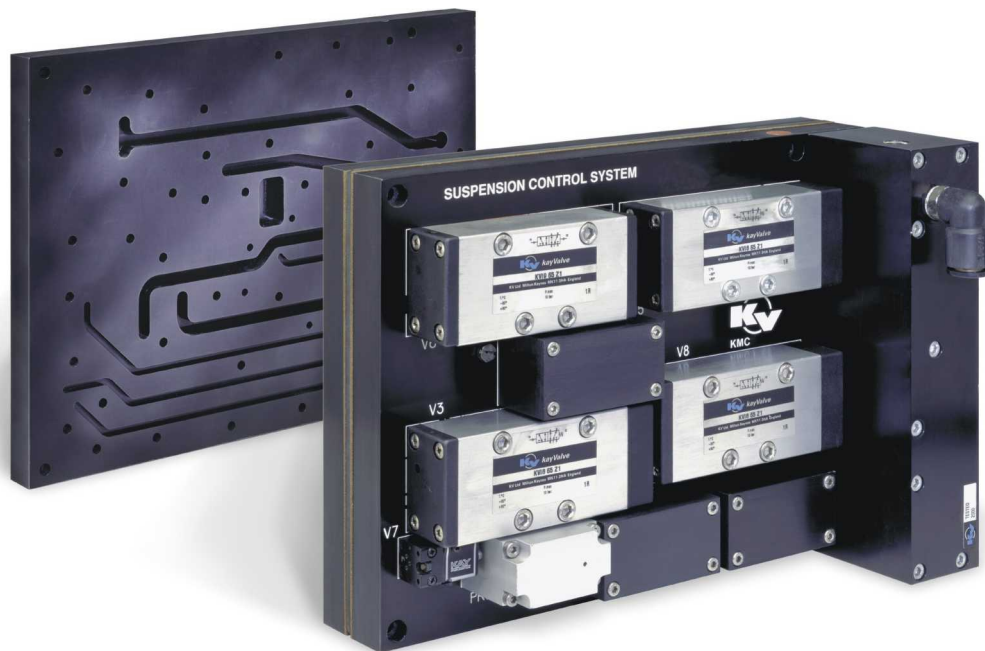
Control Module for vehicle suspension system