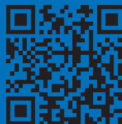
QR Code data sheet